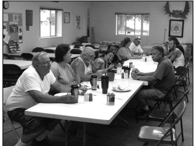
If you weren't there, you missed another great Labor Day Weekend pot luck dinner at the camp.

A reminder about the schedule change for this weekend. The Board meeting was re-scheduled for Thursday at the Lakeside Historical Society and not at the Camp on Saturday. I neglected to clarify that the Fun Trap Shoot that was to be on Sunday was cancelled because there is no Board meeting on Saturday. I plan to talk to the Board about re-scheduling and maybe inviting the Imperial County Club to join us. More to follow.